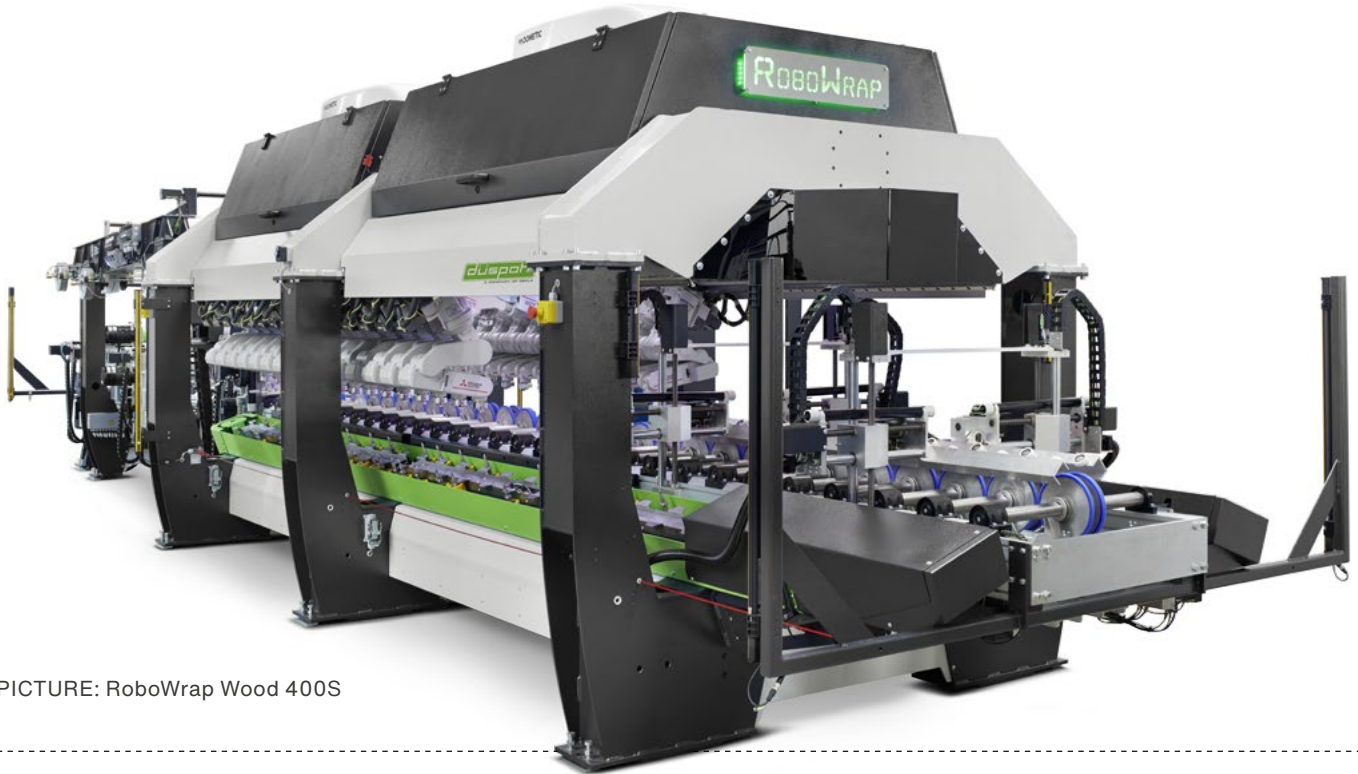
PICTURE: RoboWrap Wood 400S