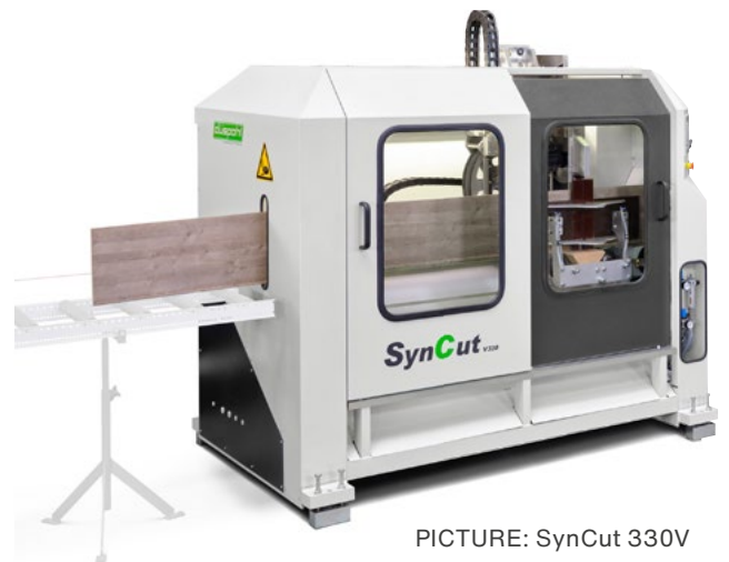
PICTURE: SynCut 330V

Automatic format adjustment: Setting-up the wrapping zone within 6 minutes