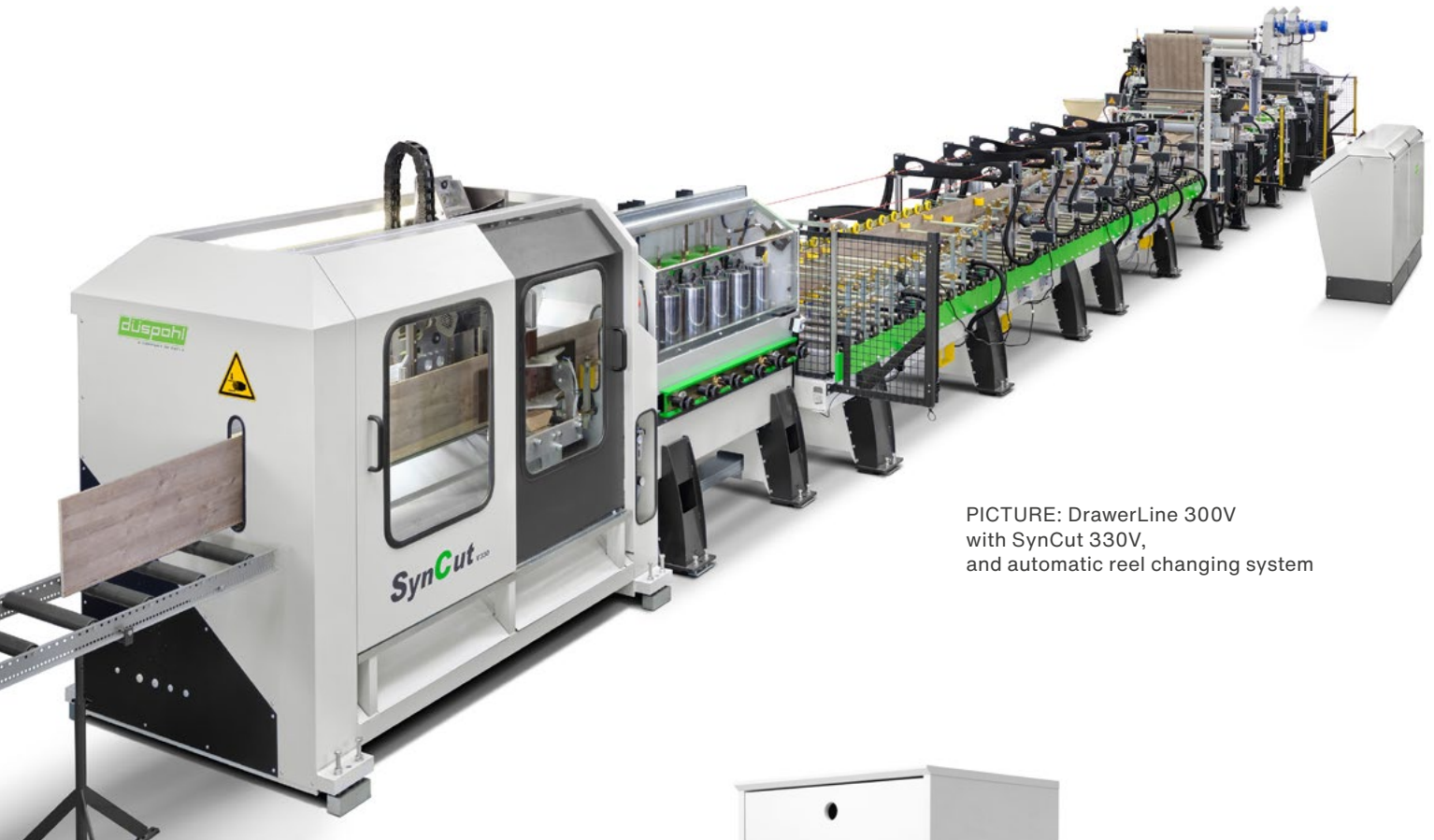
PICTURE: DrawerLine 300V with SynCut 330V, and automatic reel changing system