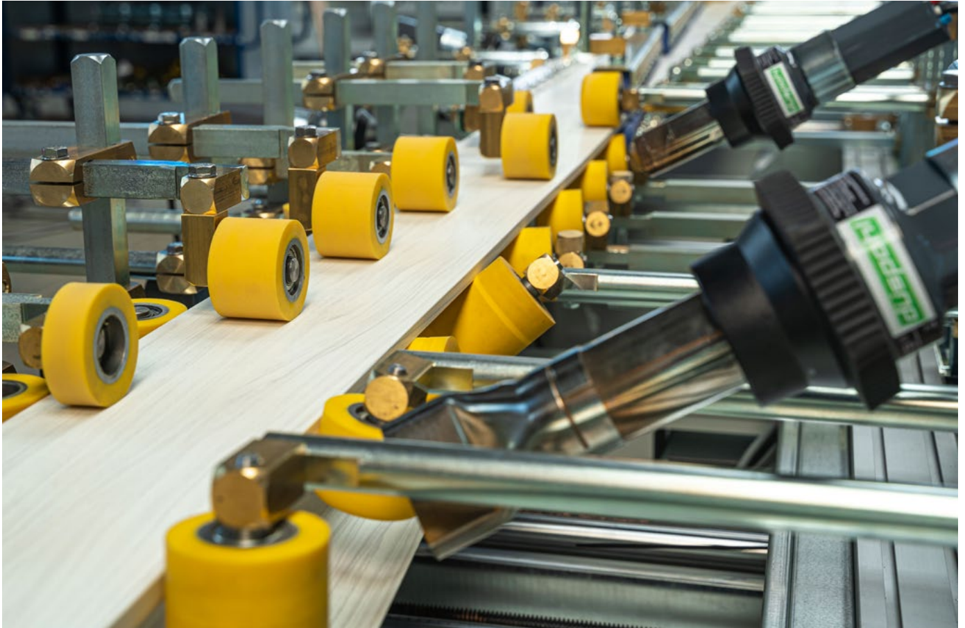
PICTURE: DrawerLine 250H Wrapping zone

HORIZONTAL 360° WRAPPING OF DRAWERS USING HOT MELT GLUE